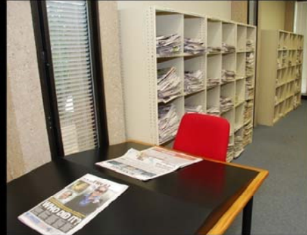
Level 2 – Print newspapers