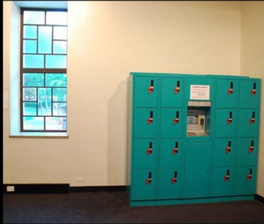
Fee paying lockers