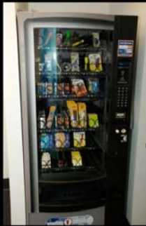
Stationery vending machine