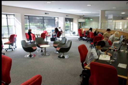
Bench and group table spaces