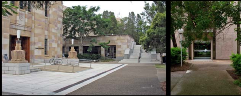
Campbell road entrances