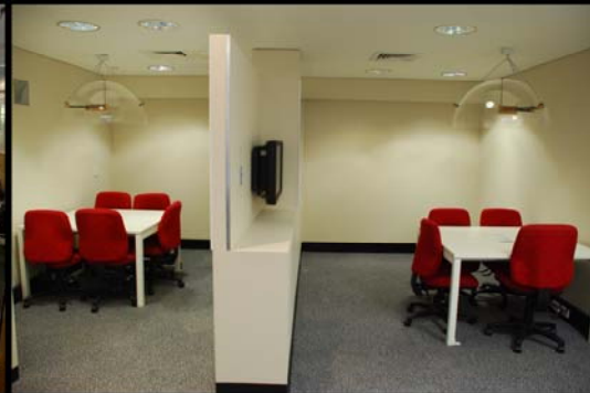
Audiovisual enhanced study tables