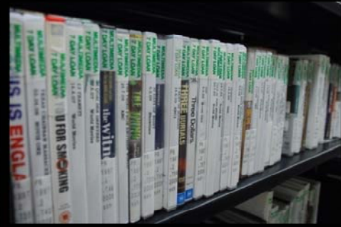
Videos/DVDs - 7 day loan