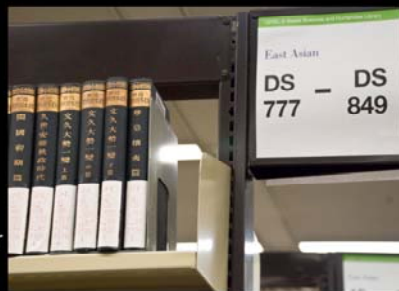
Level 4 East Asian Collection, Maps