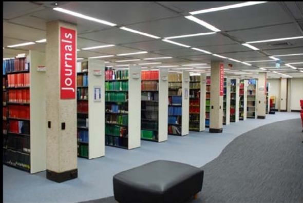
Level 2 – Print journals