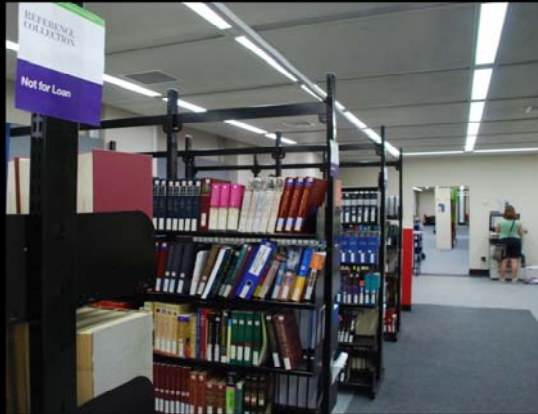
Level 2 Australian Statistics Reference Collection