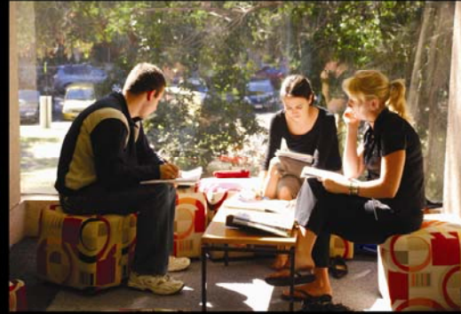
Group study spaces