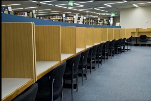
Single study spaces