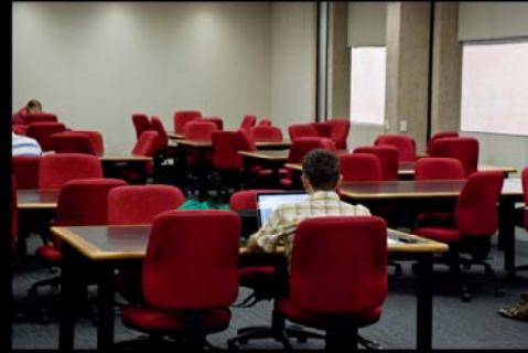
Group study tables