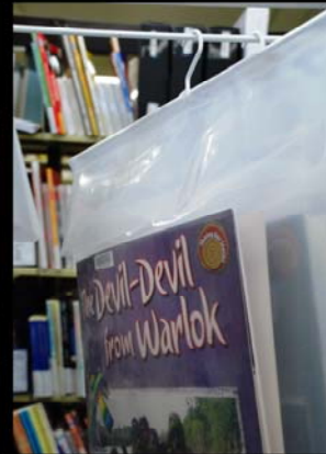
Level 4 Curriculum Collection