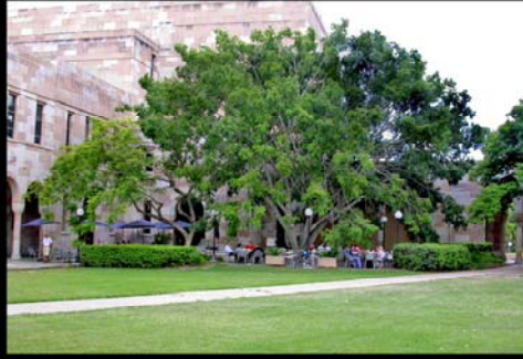
Great Court entry