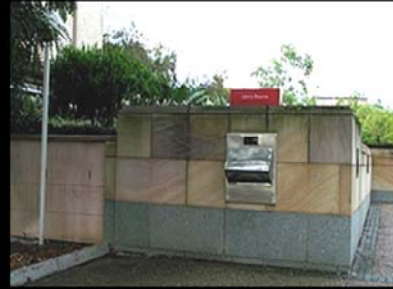
Outside return chute open all the time