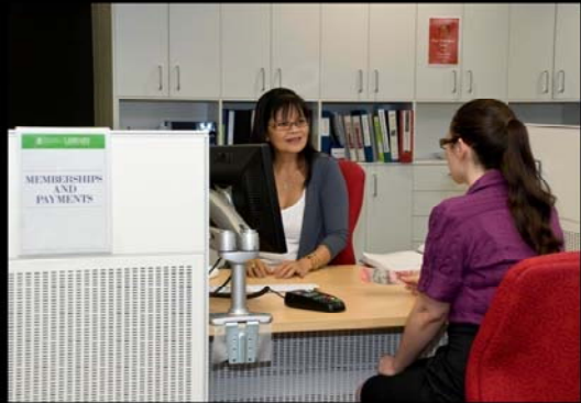
Memberships and payments