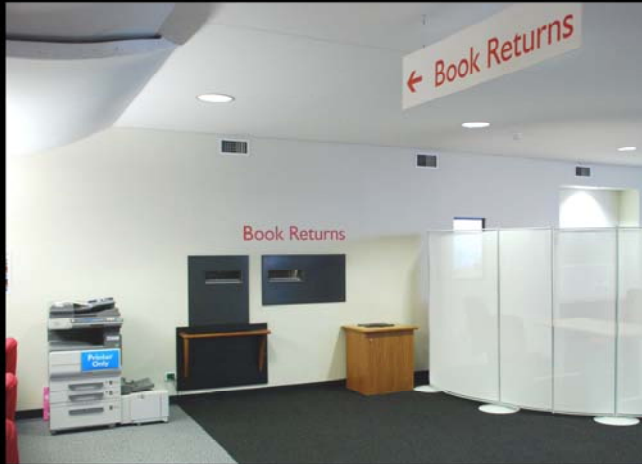
Inside return chute for when the library is open