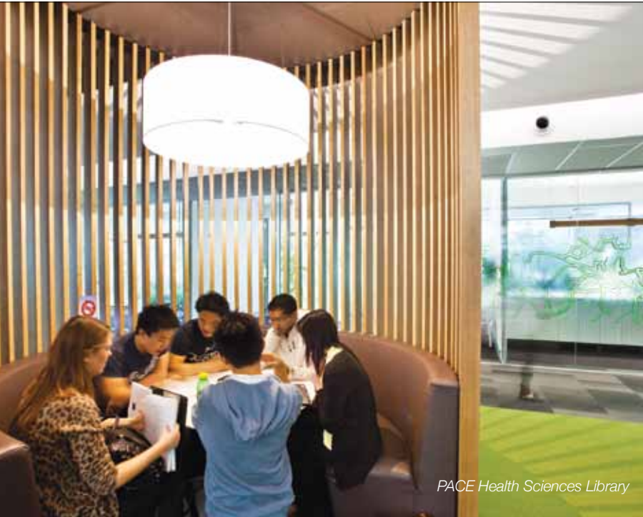
PACE Health Sciences Library