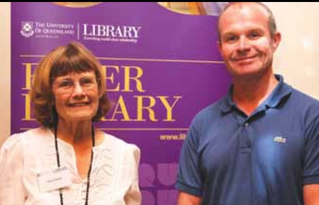
Top to bottom: Former Queensland Premier, Peter Beattie, at the launch of Fryer Library's new publication – Found in Fryer