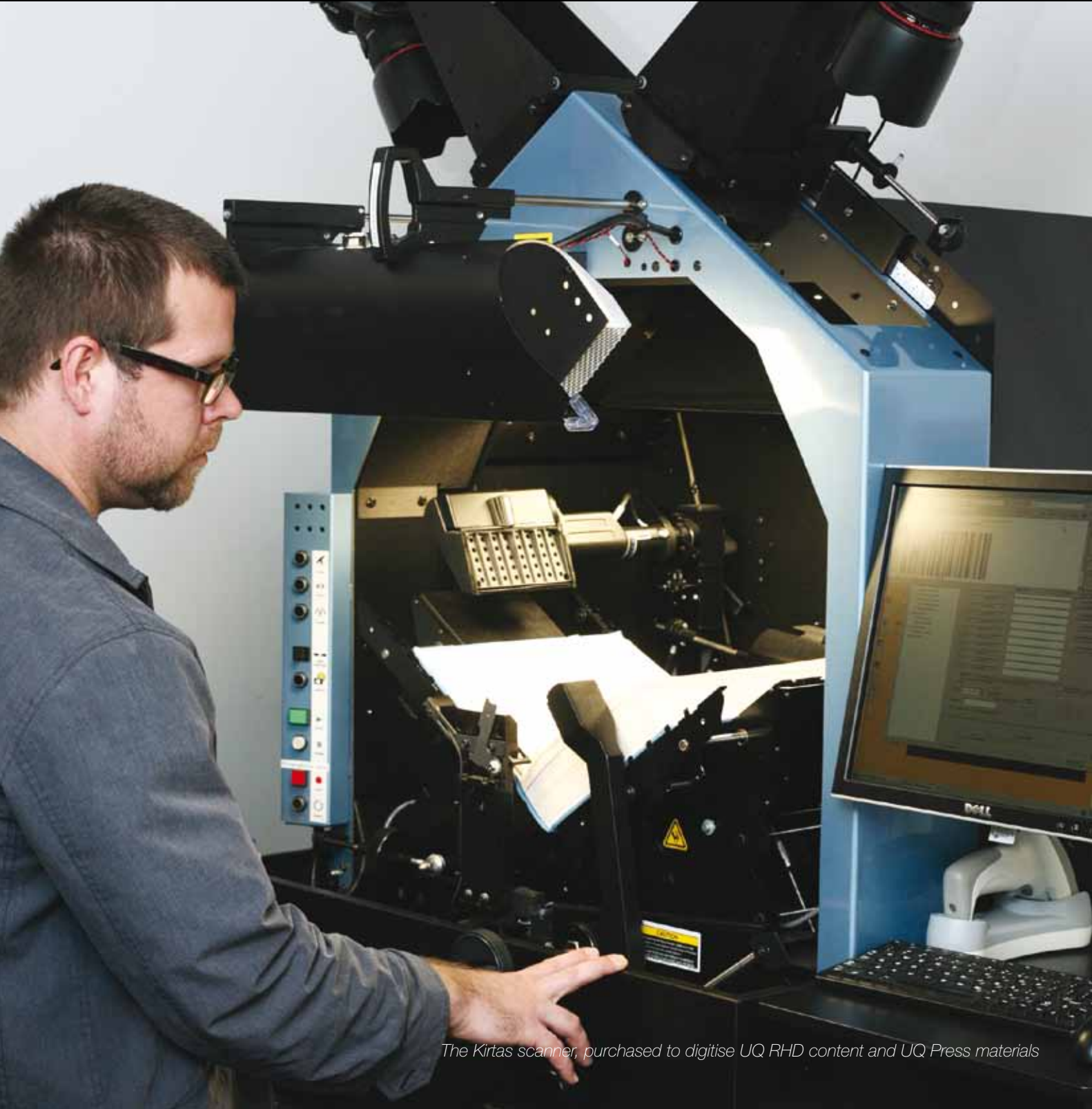
The Kirtas scanner, purchased to digitise UQ RHD content and UQ Press materials